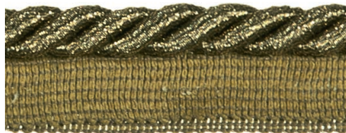
Ø 10 C/F